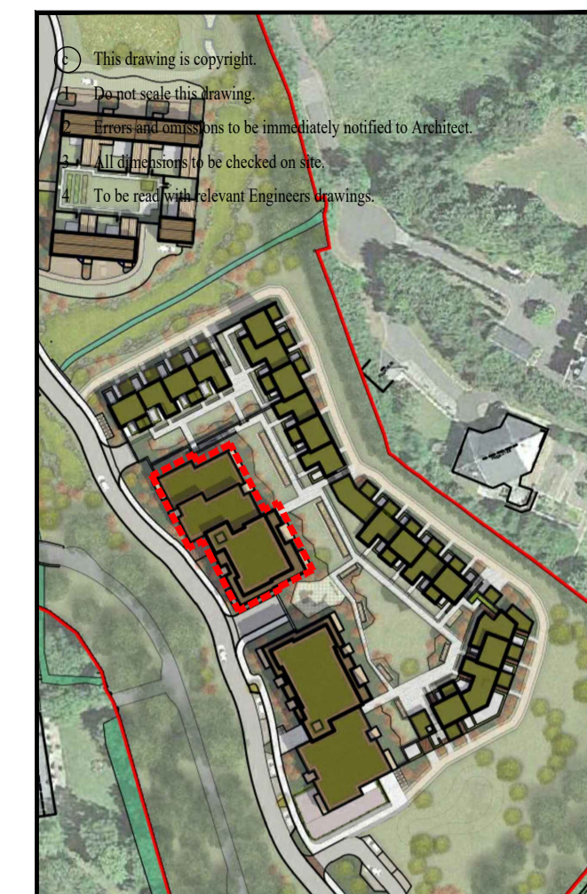
KEY PLAN INDICATING POSITION OF APARTMENT BLOCK 5 NOT TO SCALE